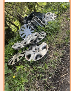
A 'cairn' of broken hub caps