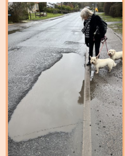
Almost anywhere on North Trade Road