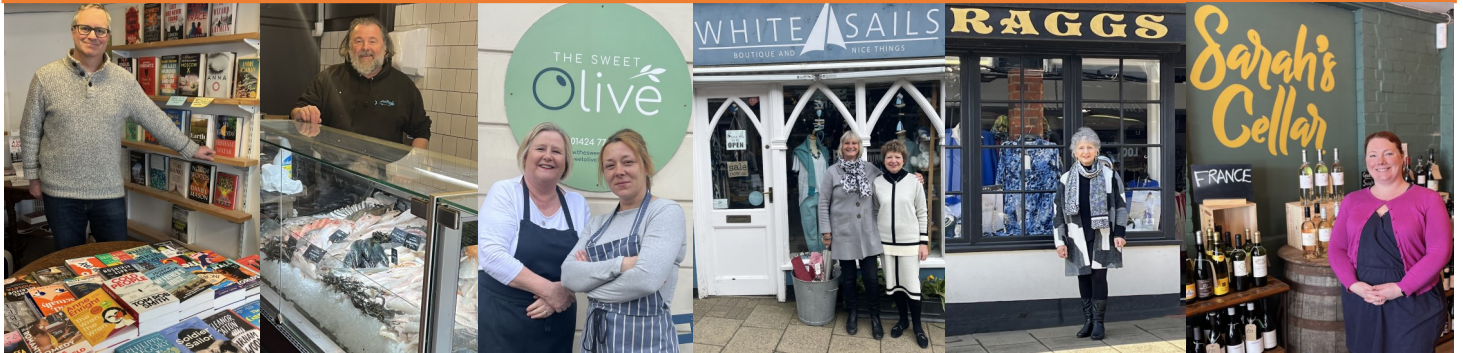
Just a small selection of the amazing range of independent shops in and around our High Street.